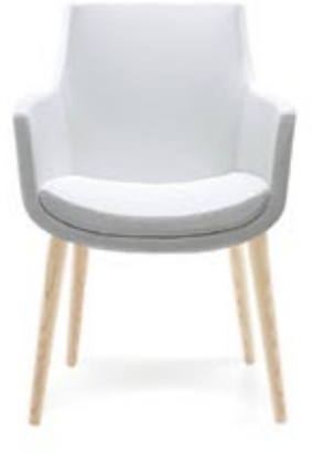
Tapered Wood Legs