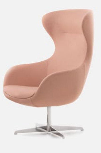
Tall X Base