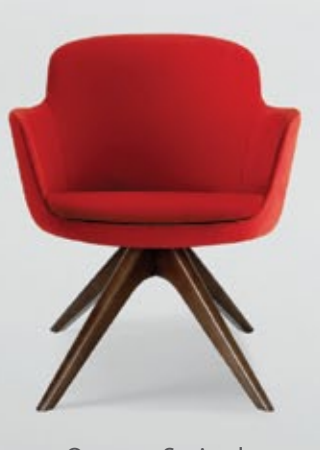
Quatre Swivel Wood Base