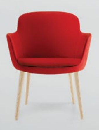
Tapered Wood Legs