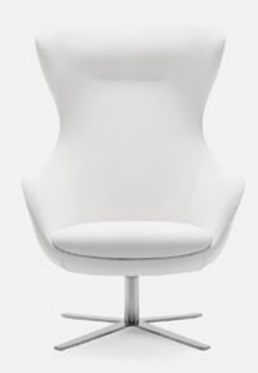
Flat X Base