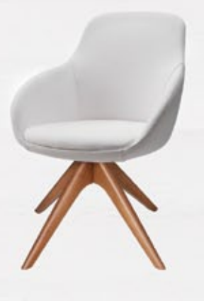
Quatre Swivel Wood Base