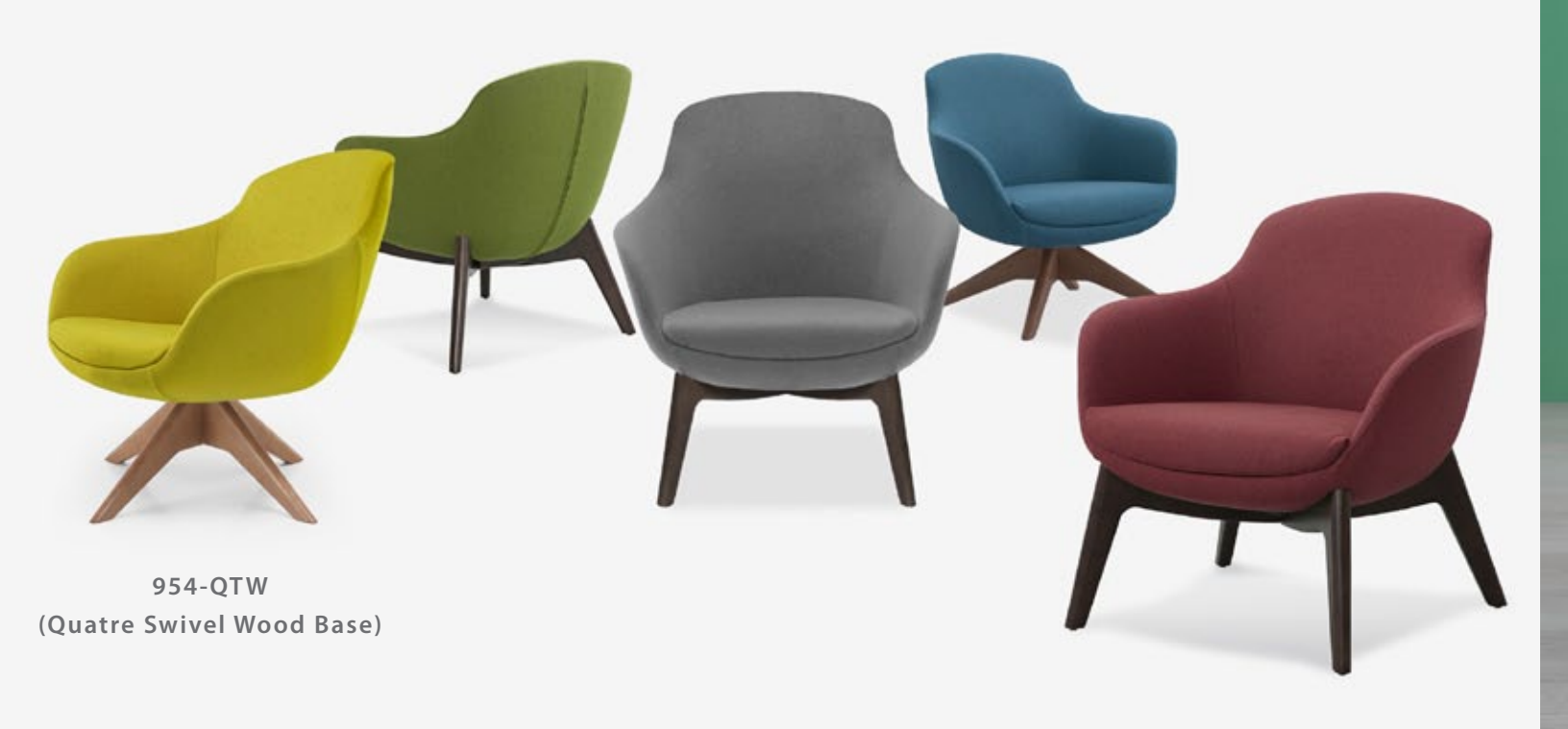
954-TWLG (Tapered Wood Legs)