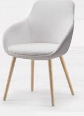
Tapered Wood Legs