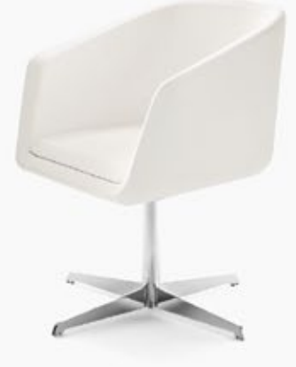
Tall X Base