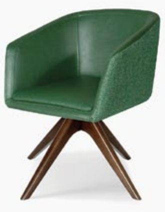
Quatre Swivel Wood Base