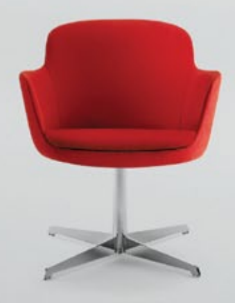
Tall X Base