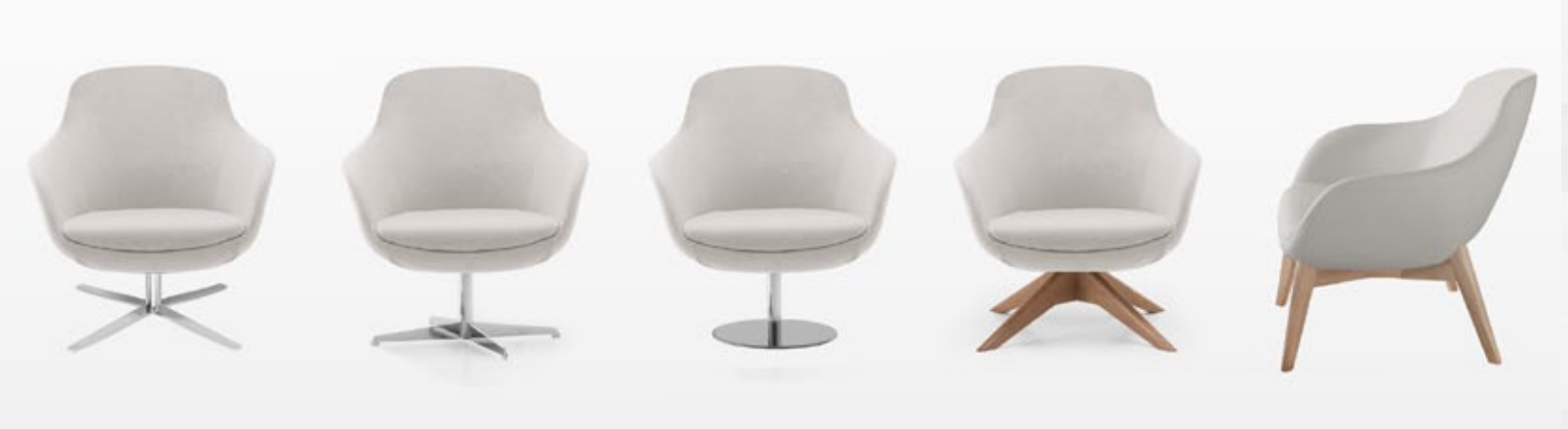
Flat X Base