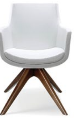
Quatre Swivel Wood Base