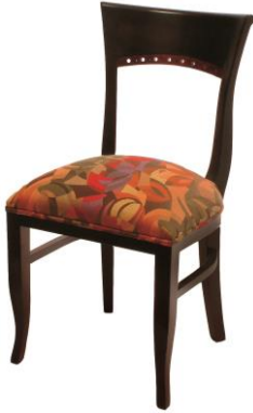
870 Botticelli Side