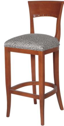
1870 Botticelli Stool