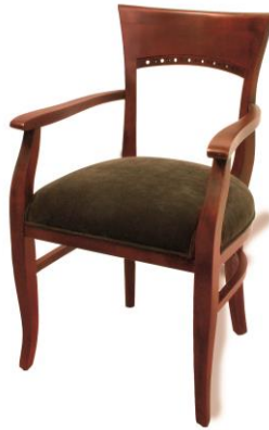
871 Botticelli Arm