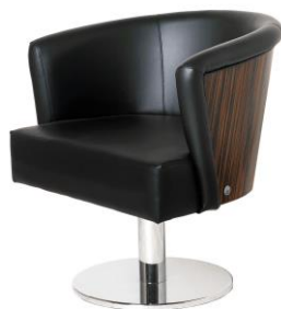
OVS/OVM – Veneer Back