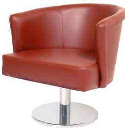
UB – Uph. Back