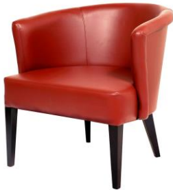
UB – Uph. Back