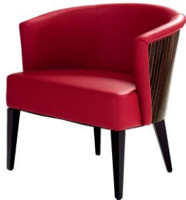
OVS/OVM – Veneer Back